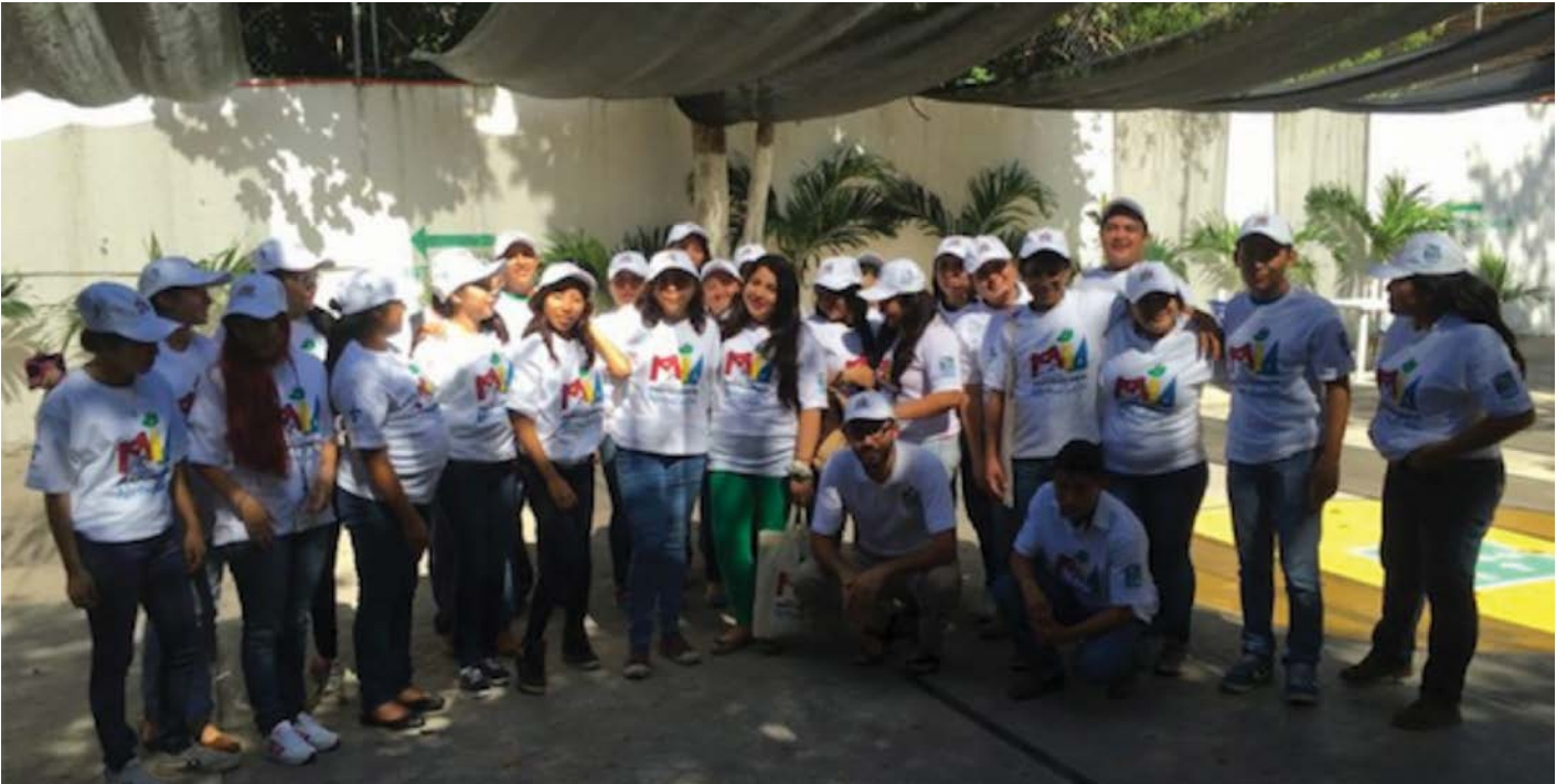
Training of facilitators. "Medicion Independiente de Aprendizajes. Mi experiencia en MIA". 2016.

MIA Mexico trains volunteers to use the MIA Plus methodology. These volunteers are either university graduates who participated in MIA assessments or people who belong to a partner women's civil society organisation. MIA Mexico does not train schoolteachers, but school boards and teachers decide which school classes would benefit the most from MIA volunteers support.