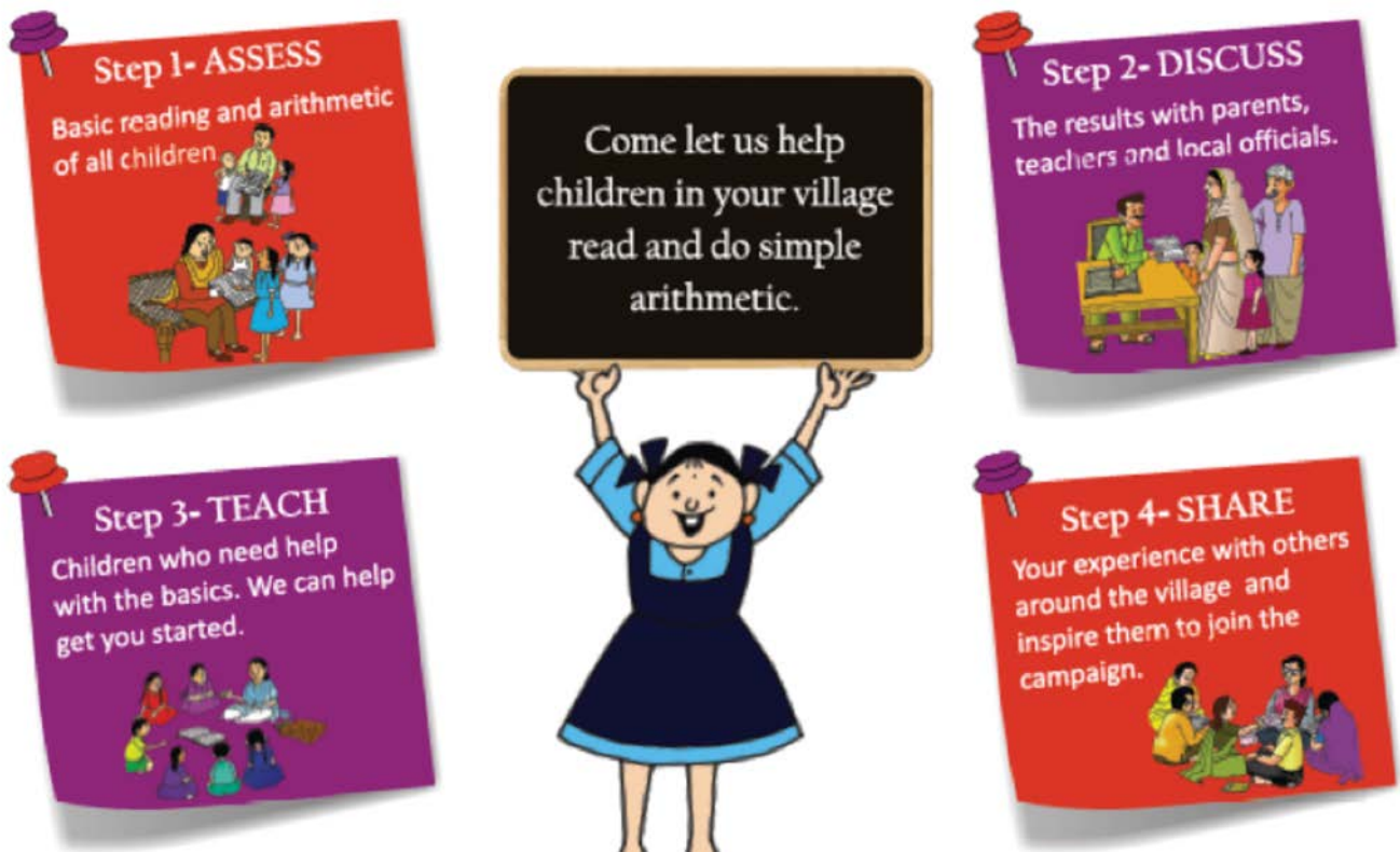
Steps to help community members improve learning levels in their villages. Village Poster English of Lakhon mein Ek Campaign.

You can help! (Village leader) and friends have taken a giant step to improve the learning levels of children in your village. Help them to change your village into a reading village!