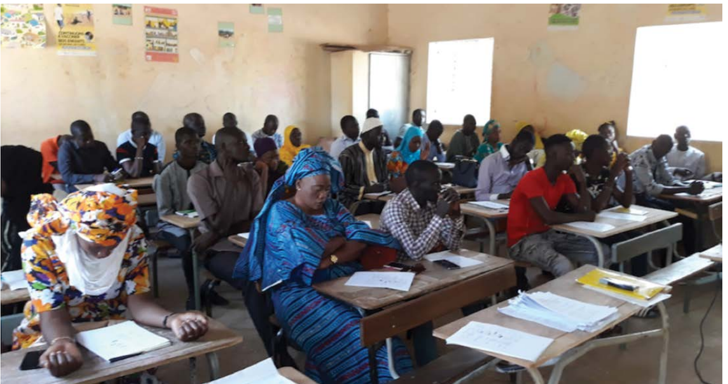
Training of remediation team members 2016.

In Senegal, the training has focused mainly on school teachers but community volunteers have also been trained to implement remediation activities for children in local spaces. These include children from the lowest learning levels (what Jàngadoo identifies in the baseline assessment as group 1; children who can hardly identify words). Jàngadoo Senegal has now joined a partnership with national and regional government to spread remedial teacher's training programmes.