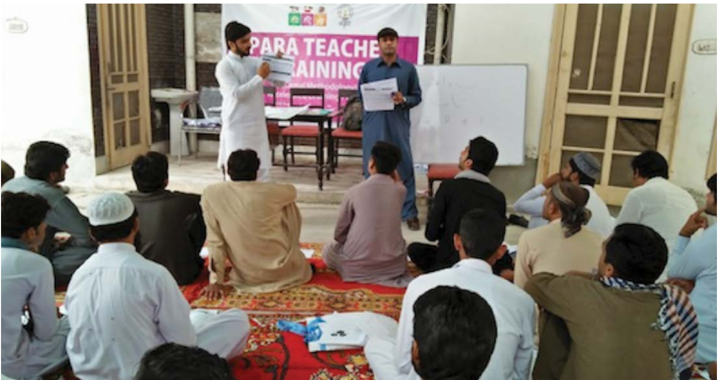
Training of para-teachers in DI KHAN. 2018.

Training. As the country with the longest history of working on learning interventions following citizen-led assessment data, Pratham/ASER India developed a specific teacher's training programme after signing agreements with national and district education institutes. Pratham/ASER India's teacher training programme is conducted in partnership with SCERTs and DIETs. Meanwhile, ASER Pakistan hires para-teachers and schoolteachers who are recruited and trained by ITA in the Combined Activities for Maximized Learning (CAMAL) methodology to conduct Chalo Parho Barho camps in local government schools.