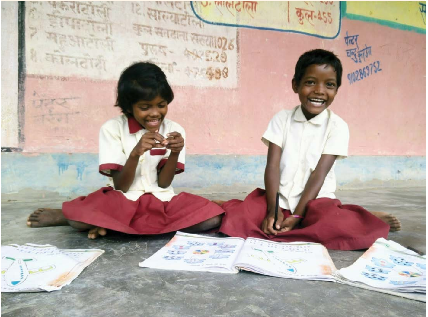
Children participating in a Read India intervention. December 2017.

Pratham's Read India uses the Combined Activities for Maximized Learning (CAMaL) approach in its interventions in learning camps and libraries. These interventions reached more than 20,000 villages and communities between 2016 and 2017.