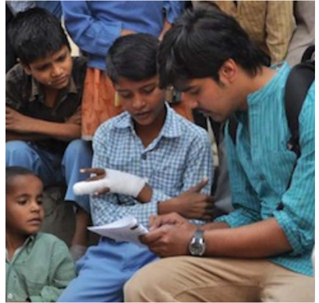
Learning assessment in Senegal 2017.